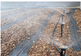
Misters In Operation

Operation: For best results, irrigate to maintain consistent soil moisture, but avoid "flooding" the root zone. This kit is modular and expandable. See recommended items or visit our web site for more products and information.