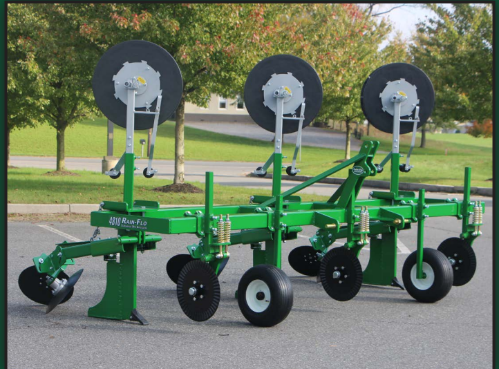
Replaceable shank tooth