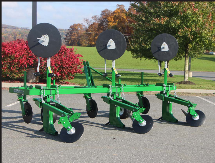
Roller guides to prevent tape twist