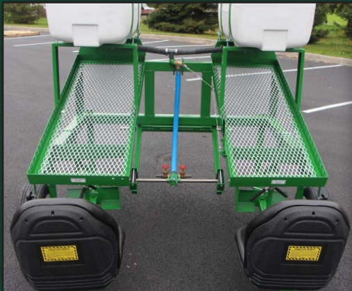
Notice: fully open back