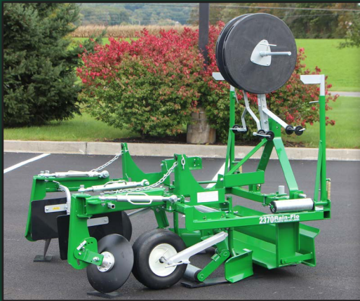
Model 2370 flat bed layer