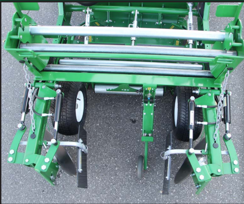
User Friendly Disk Adjustment