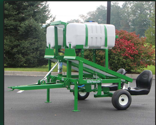
Optional trailer hitch