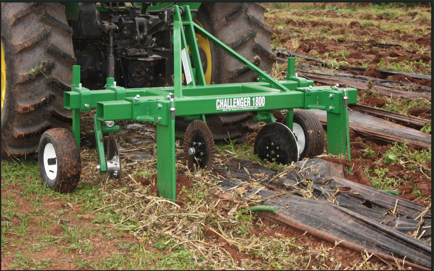
Model 1800 Mulch Lifter