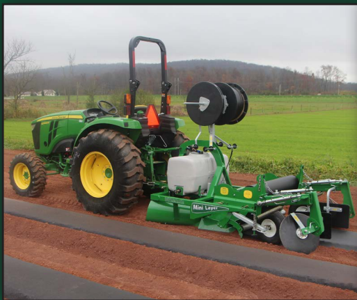
Designed for compact tractors