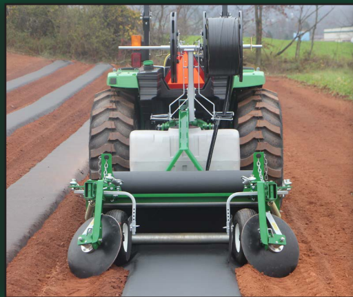
Ideal for small acreage