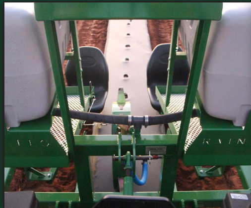
Clear view to the plastic row!!