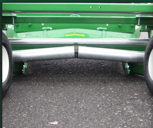
Crowned Raised Bed