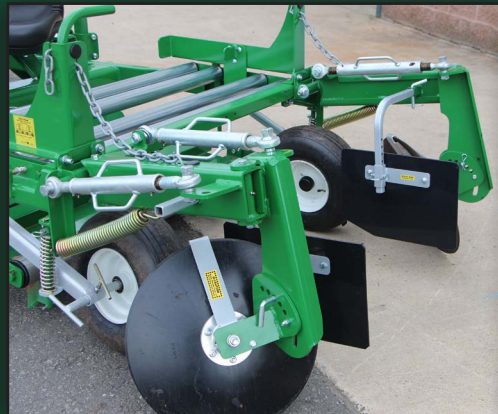
Turnbuckle Disk Adjustment