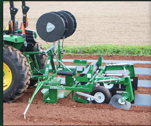
Ideal for smaller tractors