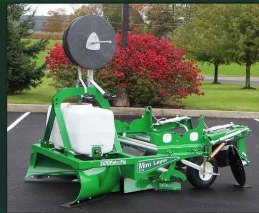
Model 2470 with center fillers