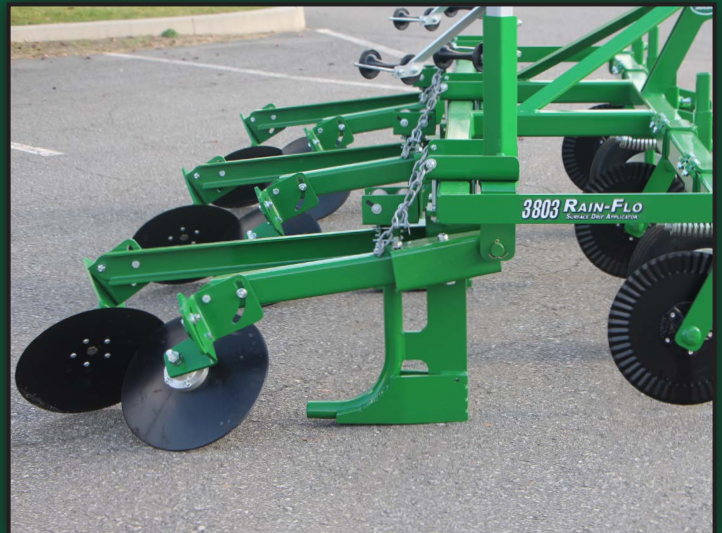
Abrasive resistant opener on shank