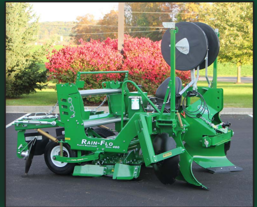
New Concept For Firmer Bed