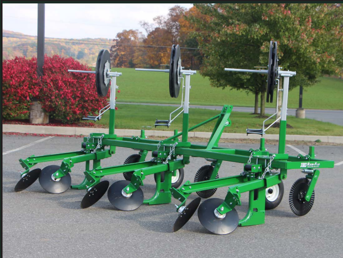
Roller guides to prevent tape twist