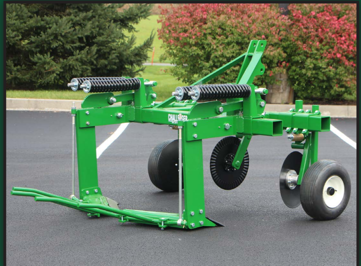
Automatic Reset Lifter