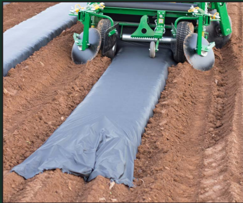
Auto Start & Plastic Mulch Cutter