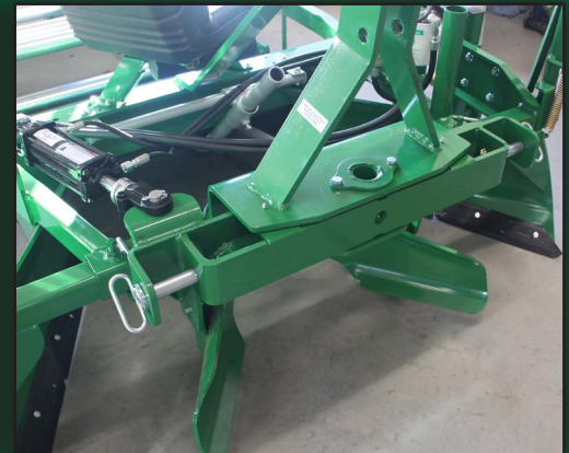
New Ro-Trak Steering Bar