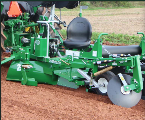
Redesigned Side Chisel