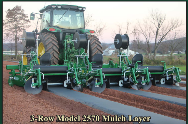
3-Row Model 2570 Mulch Layer