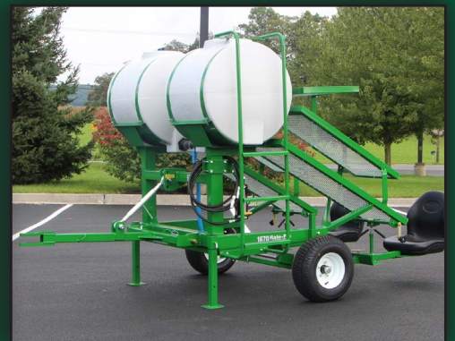
Optional trailer\3-point combination