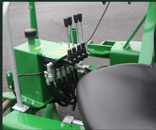
Hydraulic Cover Disk Adjustment