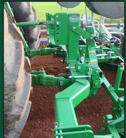
Tool bar designed for narrow row spacing