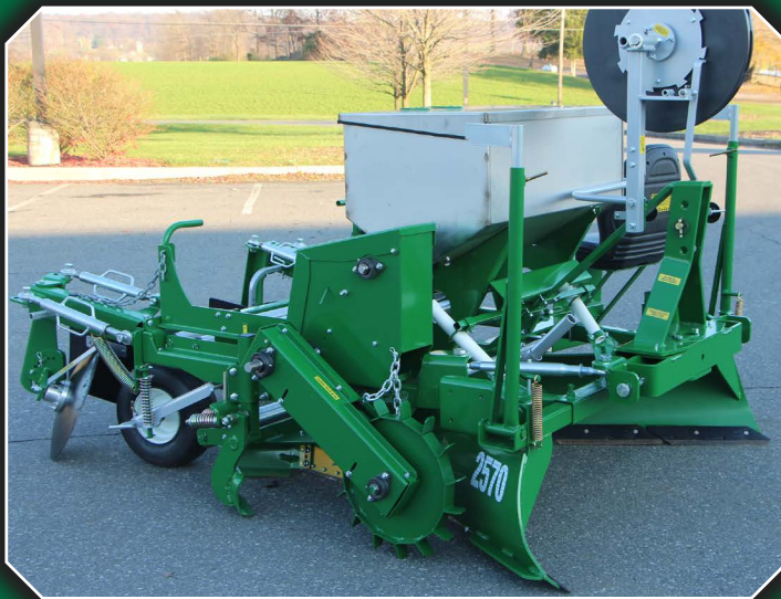
Drive wheel and gear box