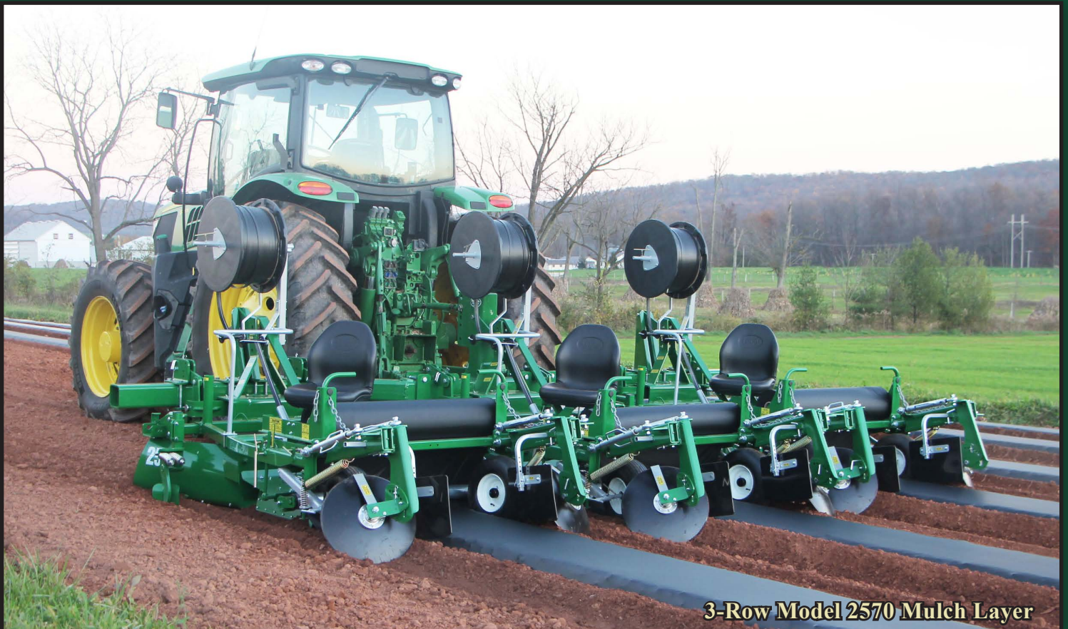
3-Row Model 2570 Mulch Layer