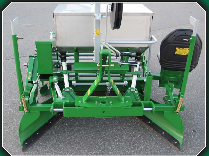
Front view of fertilizer hopper