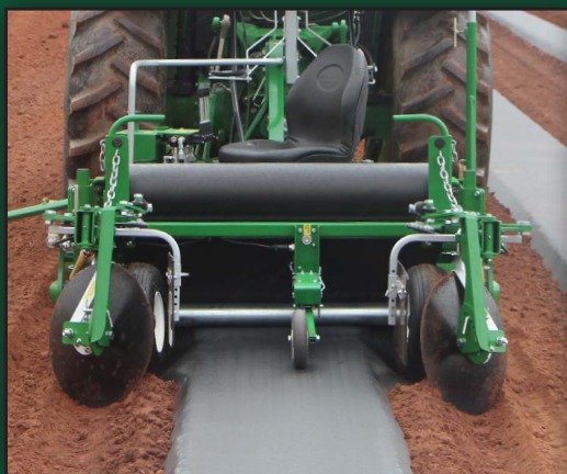
Automatic Ro-trak Sensor