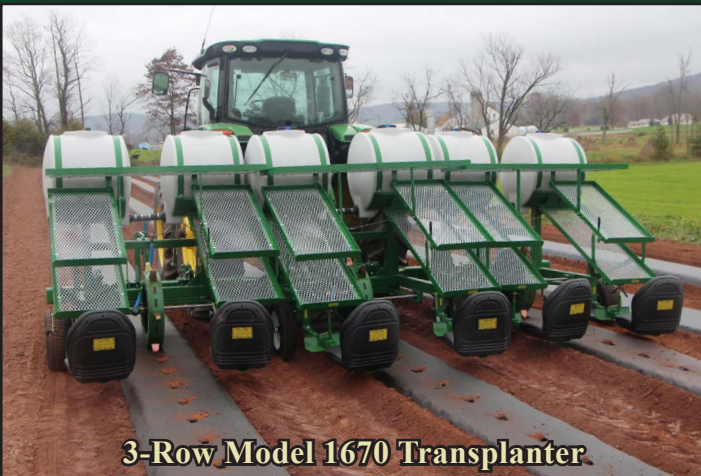
3-Row Model 1670 Transplanter