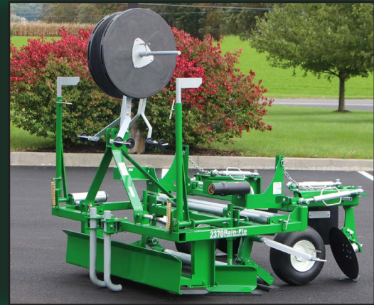
Showing leveling blade and trench opener