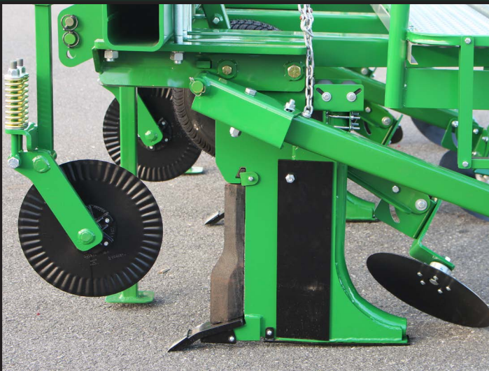
Build with replaceable wear points