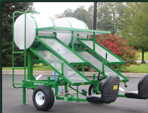
Optional top tray & side ladder