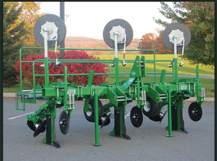
Heavy duty machine for large acreage