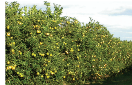
Improved fruit set